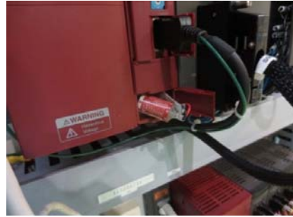
PLC by Fuji Electric