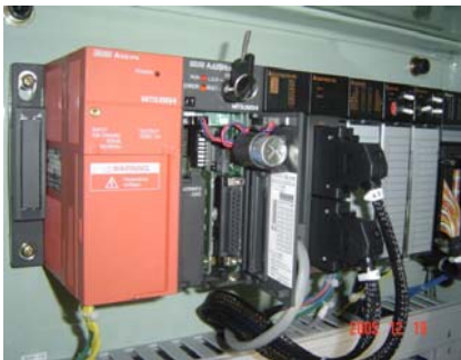
PLC (A series) by Mitsubishi Electric