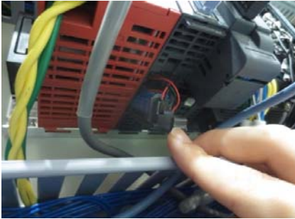
PLC (Q series) by Mitsubishi Electric

※PLC means Programmable Logic Controller